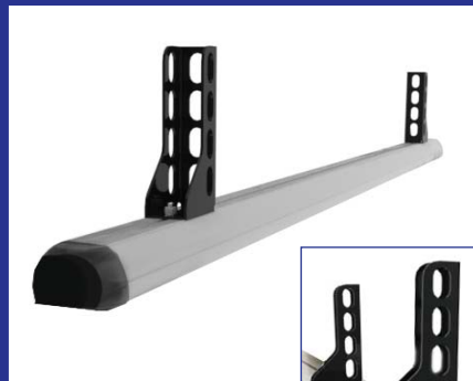
SIDE LOAD STOPS