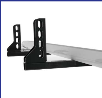
FRONT LOAD STOPS